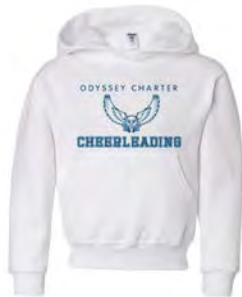
JERZEES® - Youth NuBlend® Pullover Hooded Sweatshirt

Online Store Deadline: Sunday February 9th, 2020 (11:59pm EST)